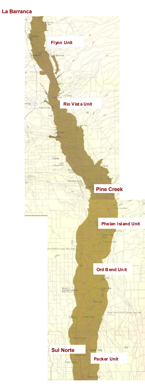
Figure 1. Map of selected SRNWR units to monitor in proposed VELB colonization study.