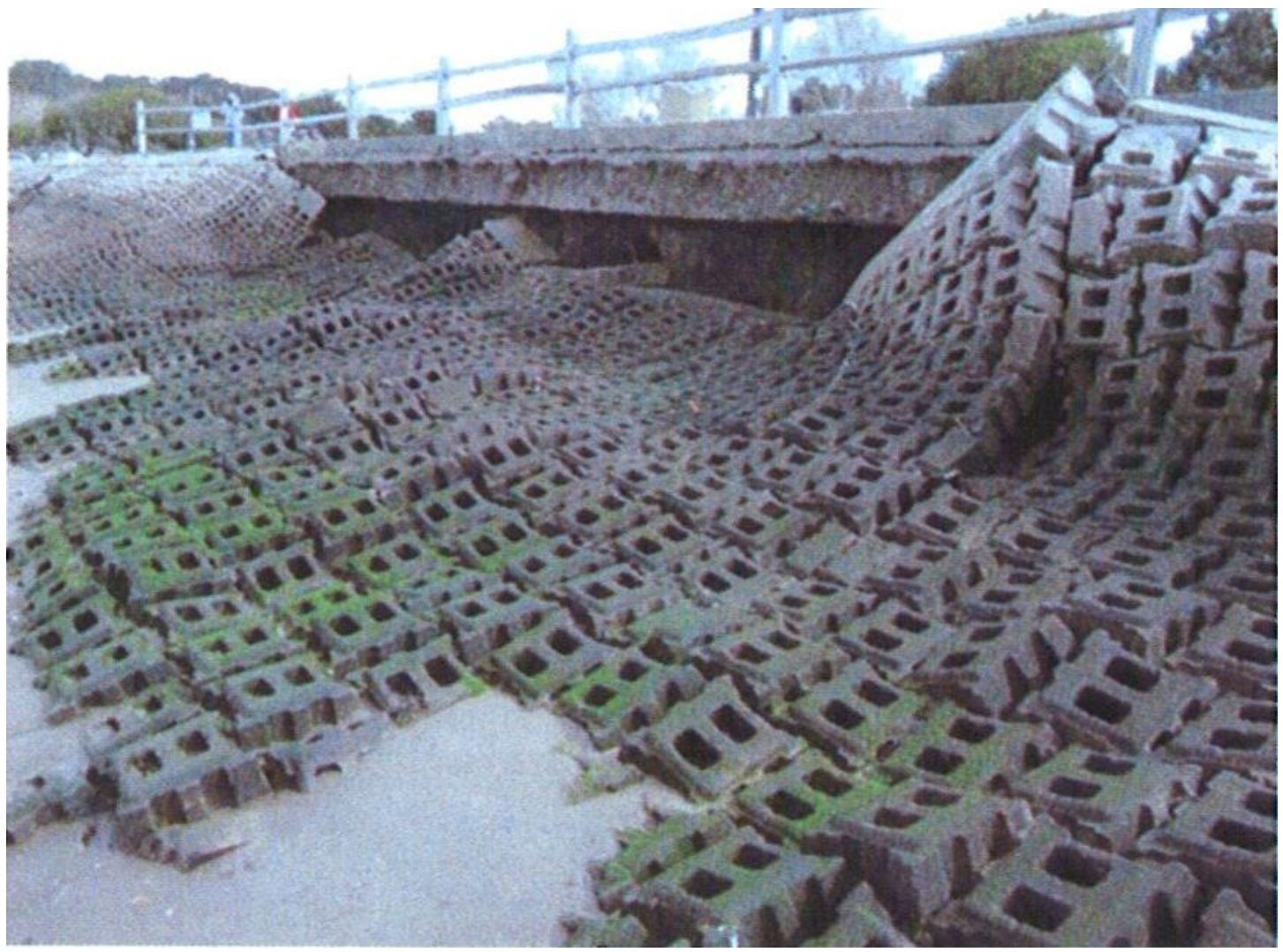
Image 1: Photo shows failed shoreline armoring prior to the project. Concrete blocks have separated from the Promenade pathway. Public access ramps for watersports are neither safe nor easy to use.