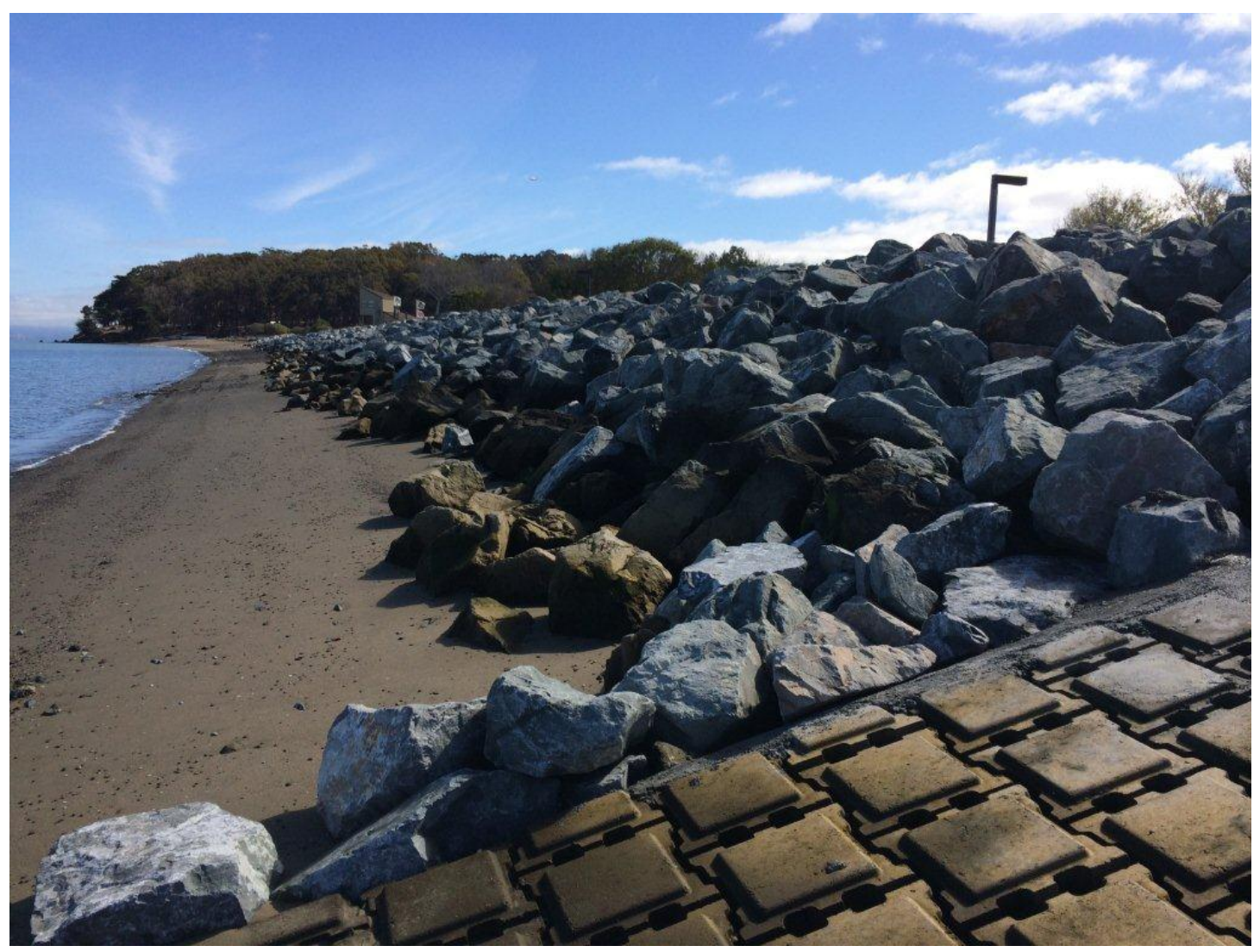
Image 7: View of another new ramp and shoreline revetment built to withstand tides and wind (post-project).