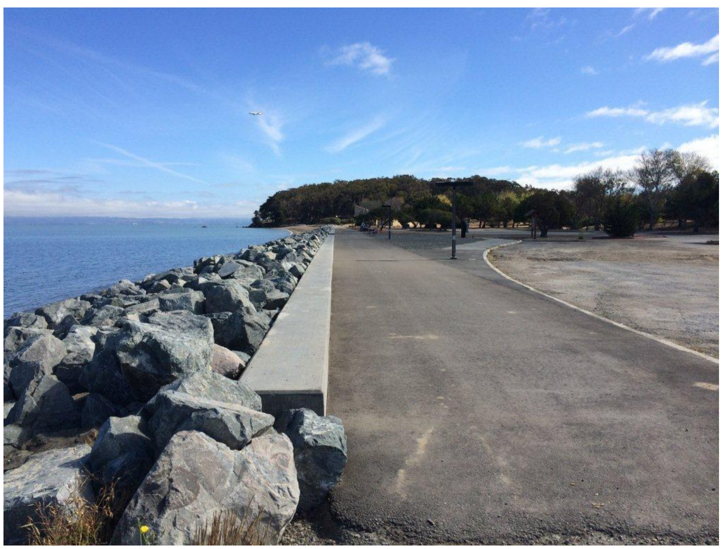
Image 8: View of Promenade showing newly paved trail that links to other park pathways (post project). Photo shows new curb/seating wall and adequate revetment.