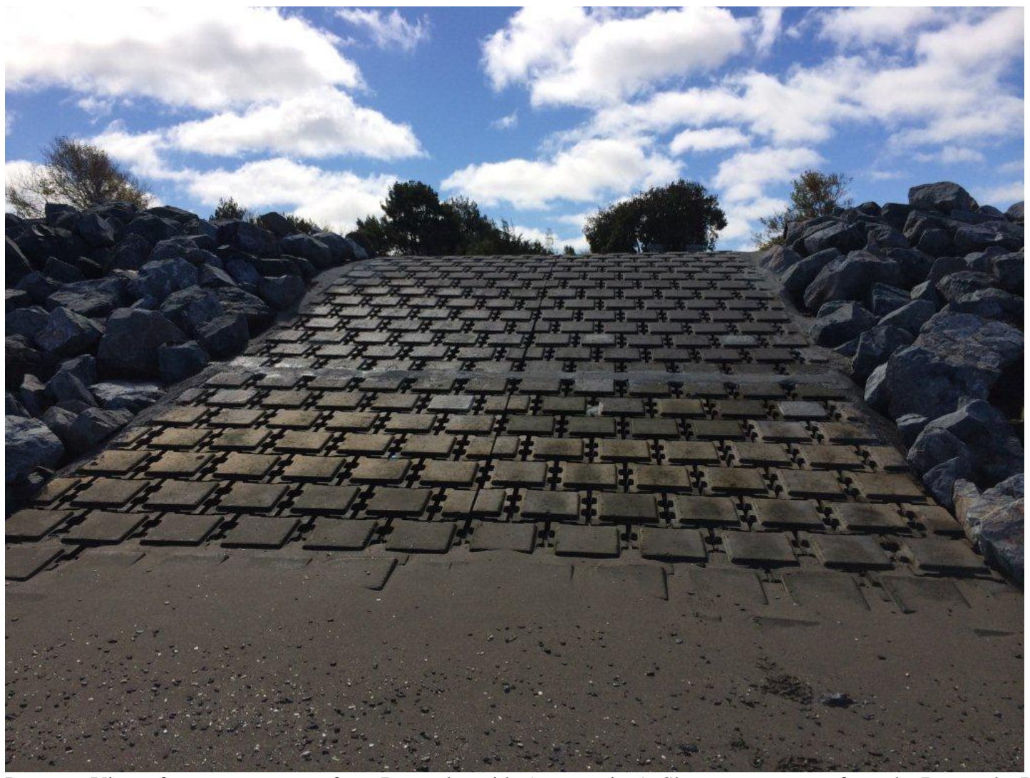
Image 6: View of new access ramp from Bay at low tide (post-project). Shows easy access from the Bay to the Promenade for recreational users who carry boats, boards and sails.