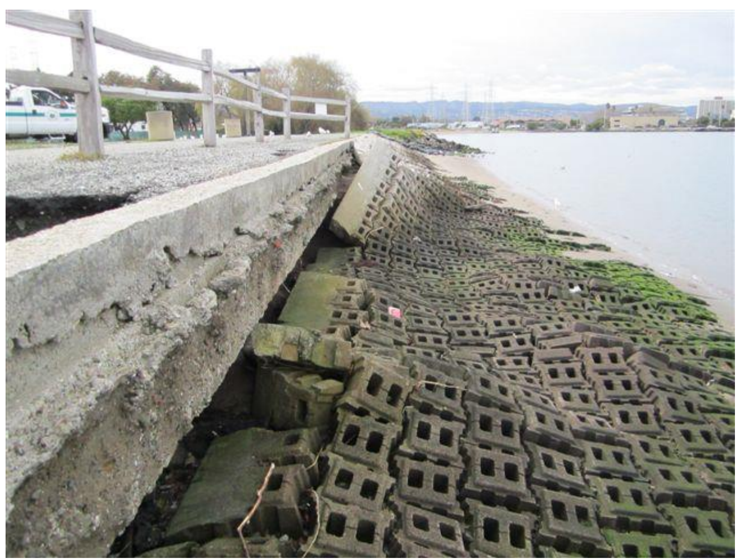
Image 2: Photo shows buckling of public access ramps and lack of revetment prior to the project.